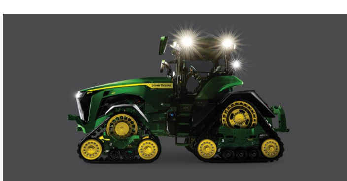
ICONIC GREEN AND YELLOW MACHINES